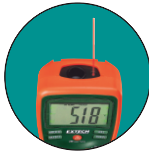
InfraRed Thermometer with built-in laser! US Patent 7,056,012